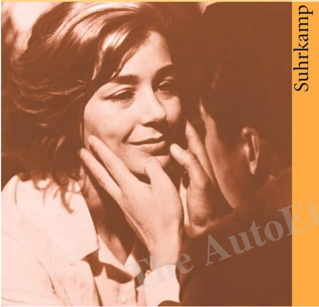
Hiroshima Mon Amour Book cover

[1] Zona is also called shingles in English. Chicken pox (varicella) virus causes zona.