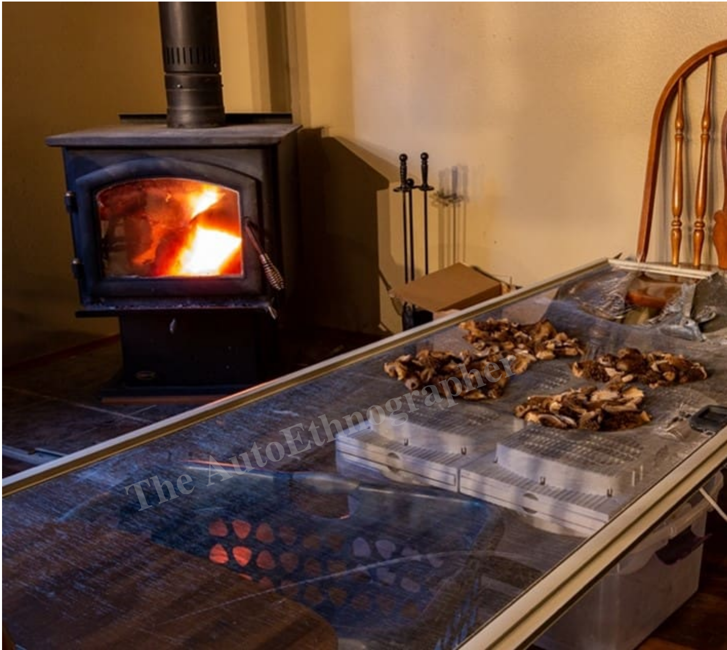
Drying morel mushrooms