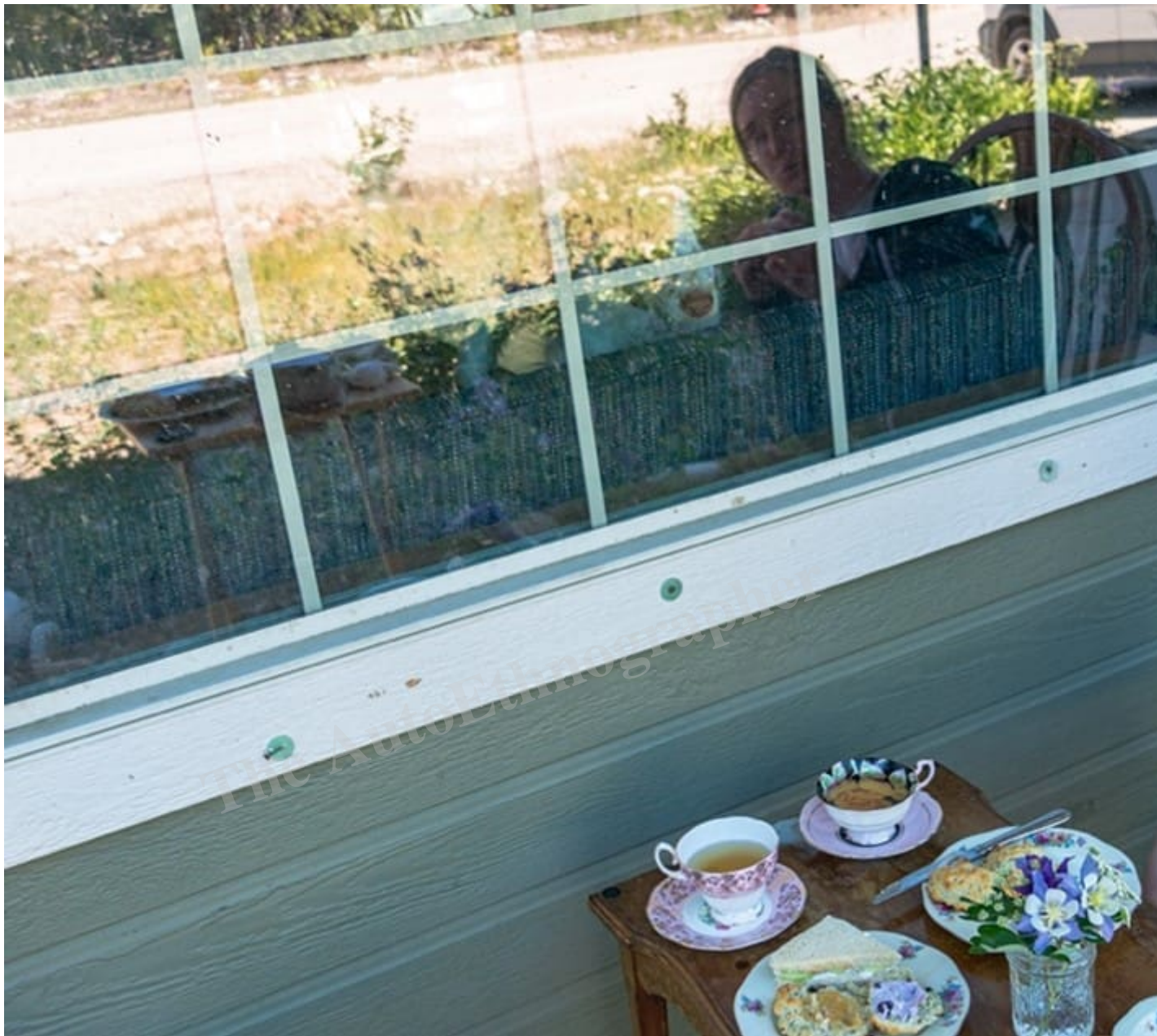
Tea party with Grandma's China and huckleberry cream cheese