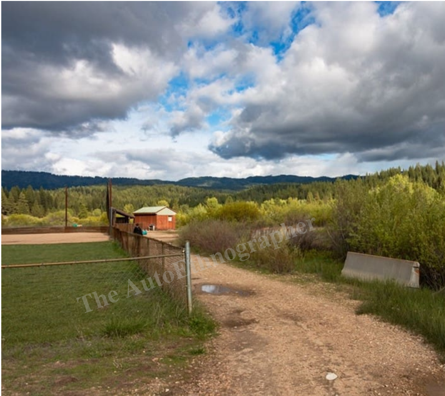
Town's baseball field