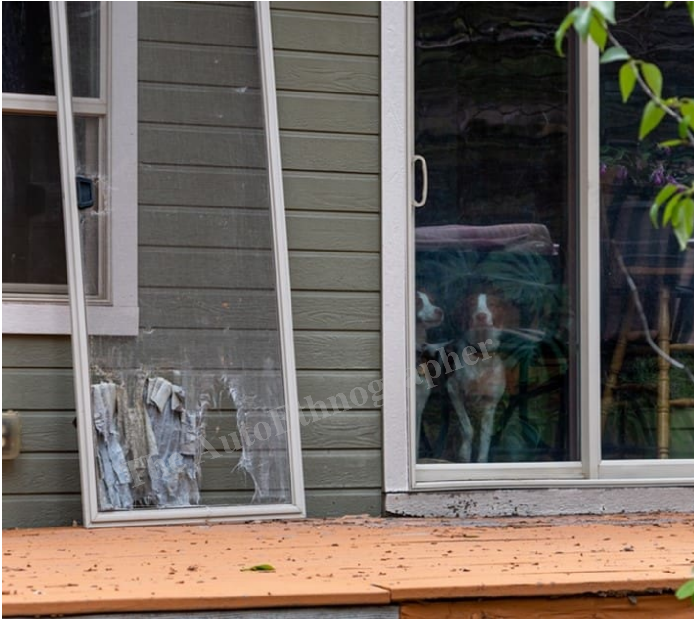
Sassy and Lola eager to play