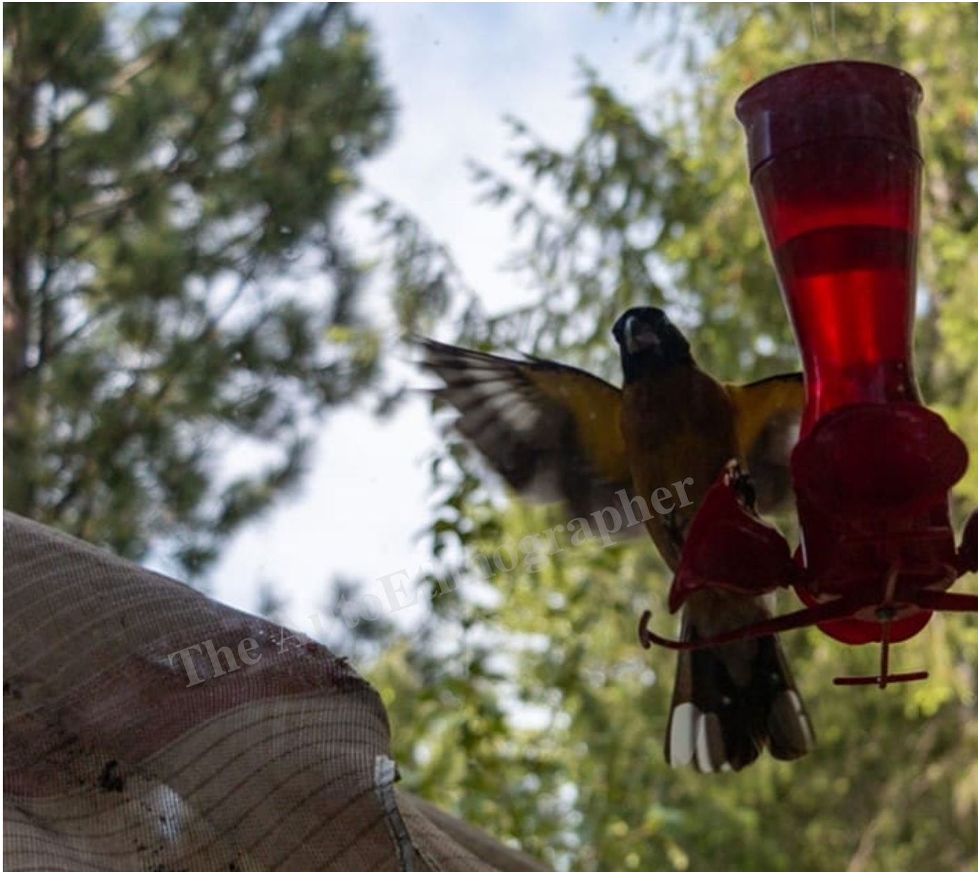
Bird stealing some nectar