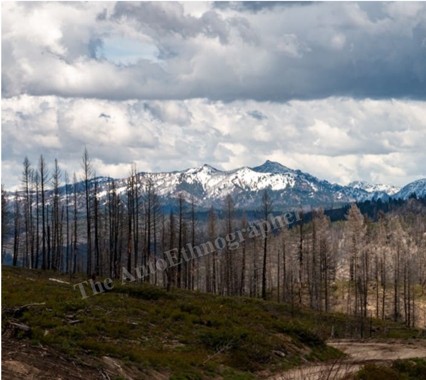
Growth after fire